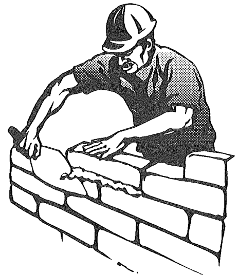
Upon What Do We Build?

Two men came to my house once. They were well dressed, smiled, devoted to what they were promoting. They approached me somewhat like the following: "Hello, we are in the neighborhood studying the Bible with people, are you interested in religious matters?" I replied that I was interested in religious matters