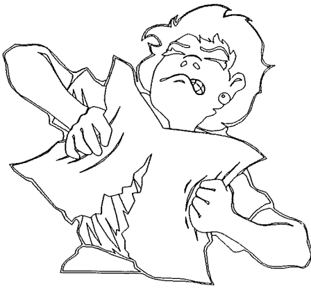
The Old Must Go

give up the absolute devotion to the Bible for all my decisions in religious matters for man-made dogmas and doctrines, why should I change?